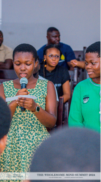
THE WHOLESOME MIND SUMMIT 2024