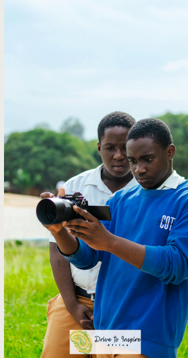
Drive to Inspire AFRICA